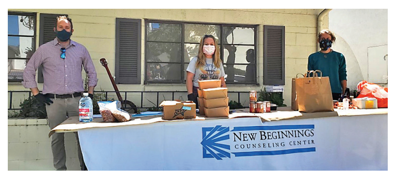
Do we have a caption for this photo? "Food distribution"

If you are a landlord or property manager interested in partnering with us to provide long-term housing to our clients, please reach out to us by calling our Development Manager at (805) 963-7777 x112 .