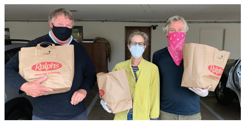
Board members distributing food

We are looking for community members who own parking lots and who would be willing to become partners in our Safe Parking Program. The lots are monitored, and New Beginnings indemnifies all lot owners against any liability. All of our clients are residents of Santa Barbara County, have a driver's license, vehicle insurance, and registration. For more information, please contact our North County Safe Parking office at (805) 430-8636 or our South County Safe Parking office at (805) 845-849 2.