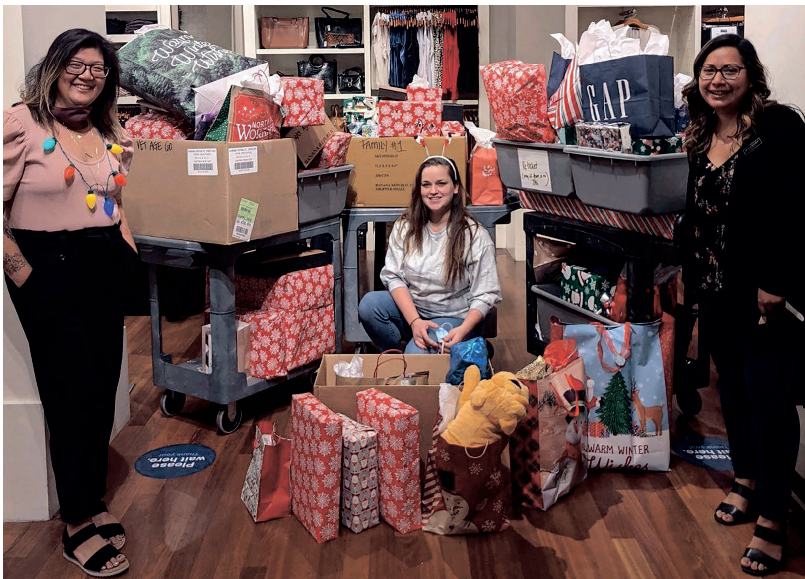
Representatives from Banana Republic stand near an assortment of gifts that were distributed by New Beginnings.