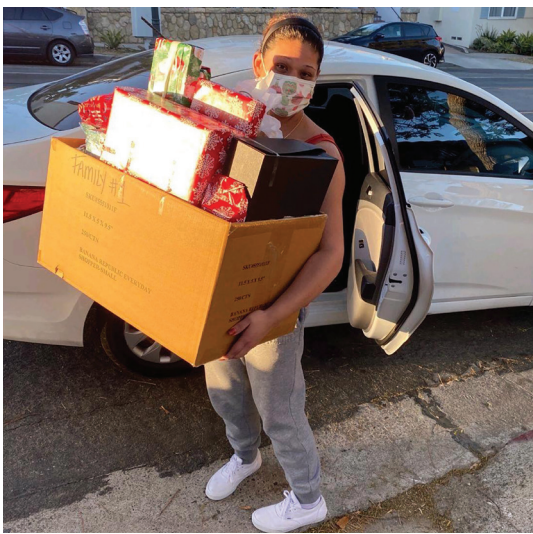
One of the recipients of this year's Adopt-a-Family program was a single mother of two, who was provided gifts for her children.

"They are able to understand, from the personal perspective, what (the client) experiences and how we can be of service," she said.